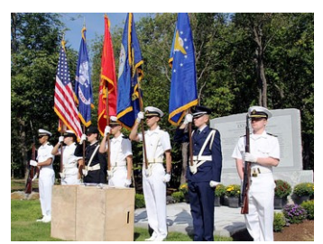
Color guard from RPI ROTC