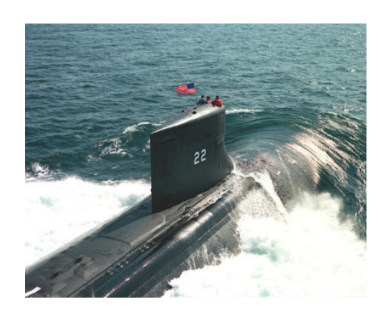
SSN 22 underway. According to public information from Electric Boat, her builder, the Seawolf-class sub is "less detectable at high speed than a Los Angeles submarine sitting at pier side".