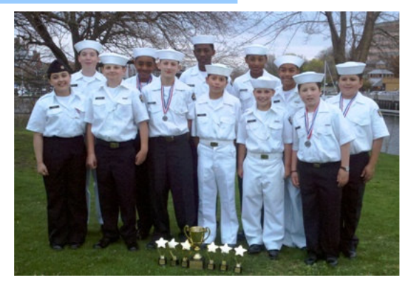
League Cadet Flagship trophy winners. Bravo Zulu!

The City has owned the building since it was gifted by the Navy. The gift stipulated the City maintain a portion of the building as a Marine Center, for use by units such as the Sea Cadets, Power Squadron and Navy League, among others. We are using our contacts to ask the City to keep us informed of their plans, and as we learn more, we may well seek assistance from our Council members to advocate for our primary mission of sponsoring the Sea Cadet youth program.