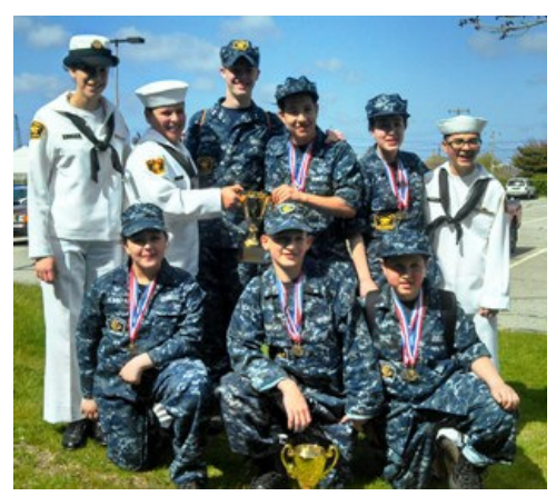
Swim team winners. Congratulations!