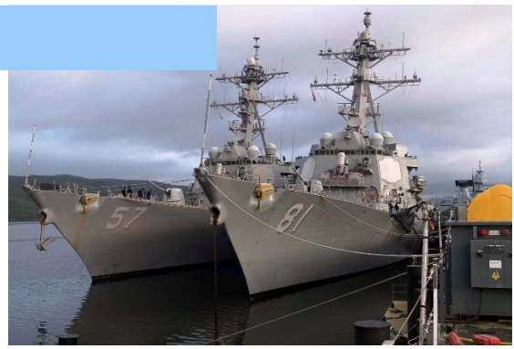
USS Winston S. Churchill with USS Mitscher in Faslane, Scotland in September.

Our Council wishes the officers and crew continued success as they hone their skills on this formidable warship, operating in our defense!