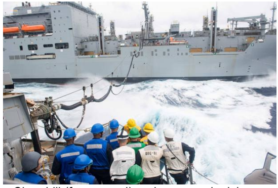
Churchill (foreground) underway replenishing in September in rough Atlantic seas.