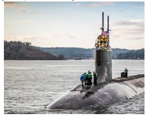
SSN 22 underway in December 2016 after lengthy stay in the yards.