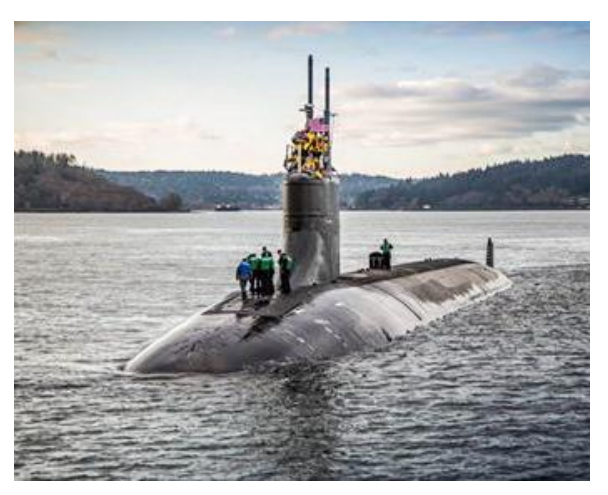
SSN 22 underway in December 2016 after lengthy stay in the yards.