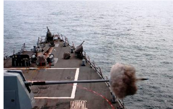
Churchill firing 5 inch gun during earlier deployment. Outgoing blurred shell can be seen leaving expanding muzzle blast.

Connecticut is one of three Seawolf subs. Originally intended as a class of 29 submarines, the end of the Cold War and budget constraints led to the reduction. The class is significantly quieter than Los Angeles-class submarine, faster, has more torpedoes tubes, and can carry more weapons.