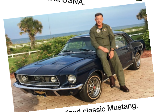
With his prized classic Mustang.