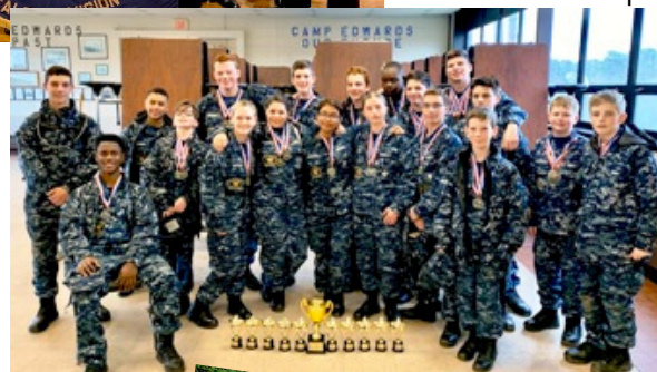
2019 Flagship champs