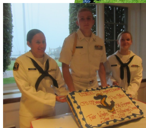
Graduating senior cadets.