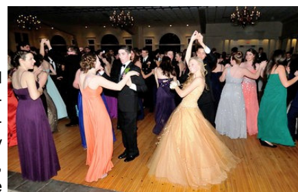
Dancing at 2014 Ball