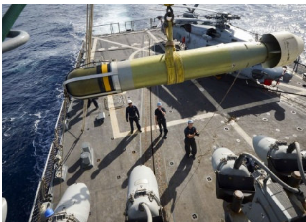
Mark 54 torpedo being hoisted over the ship's flight deck while at sea on Oct 24th.

See our Council's award-winning website for special features and timely updates that occur between the quarterly editions of this newsletter at: www.navyleaguewestct.org