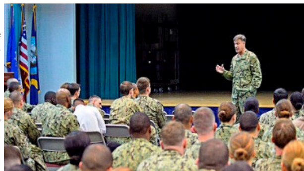
RADM Buck conducting a feedback session with enlisted sailors in Bahrain in 2014.

A copy of the event flyer, along with RSVP form, is available on our Council's website at: www.navyleaguewestct.org