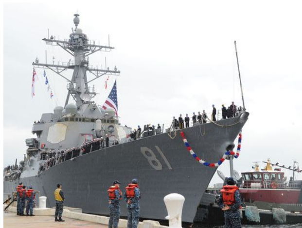
Welcome home! Churchill at pier-side in Norfolk, November 7th, returning from deployment.

With the Churchill now back in home waters, we fully expect to renew our support to the ship's company, as we have in the past.