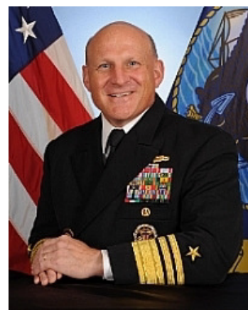
VADM Michael Gilday, guest speaker at April 1st meeting.