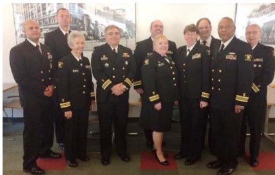
Final salute as CO.