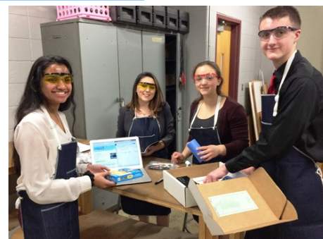
Bethel cadets building their SeaPerch sub robot.