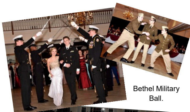
Bethel Military Ball.

By email on Jan 17th, Council members were invited to attend the 14th annual Bethel NJROTC Military Ball, to be held this year on March 5th. Nearby photos are from the March 2016 Ball. Members who have attended in the past say it is truly an impressive and fun event.