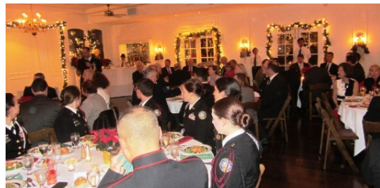
Scene from a prior annual dinner.

We will also briefly hold our Annual Meeting at the dinner for the election of Council board members for 2017.