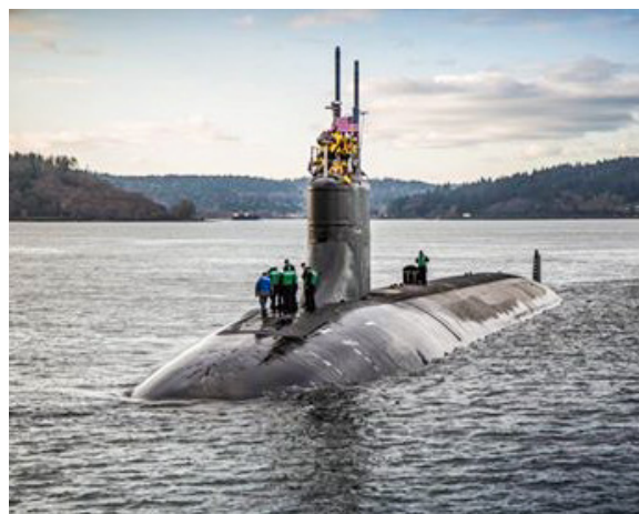
SSN 22 underway in December 2016 after lengthy stay in the yards.

Also be on the lookout for a new "ship's store" to be added to the sub's website at: www.navyleaguewestct.org/USConnecticut.html We are working to make such items as ball caps and sweatshirts available for purchase.