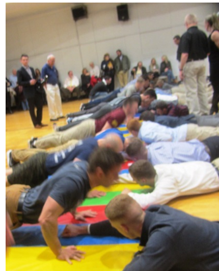
Push-up part of PST.