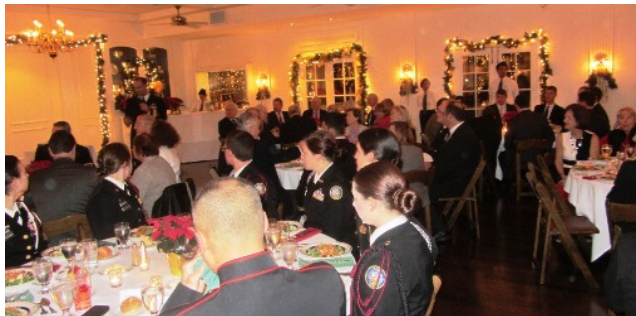
Scenes from prior annual dinners.

We will also briefly hold our Annual Meeting at the dinner to include the election of Council board members for 2019.