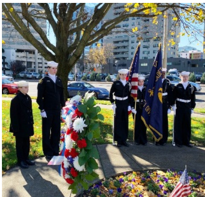
Sea Cadets at Veterans Day ceremony.