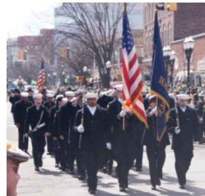
St. Patrick's Day parade.