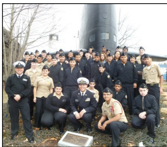
McMahon cadets in Groton during an earlier visit; in front of the sail from decommissioned USS George Washington (SSBN 598).