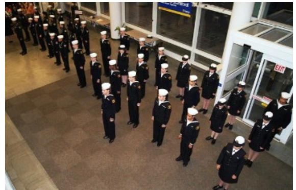
Dealey Division cadets await Annual Inspection at Stamford Government Center.

We have added a section to our website to provide detailed news on this key issue, at: www.navyleaguewestct.org/center.html