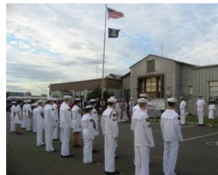
Sea Cadets at Magee Avenue Marine Center.