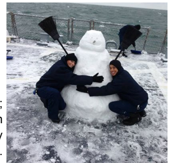
Snowman on deck; time for bit of fun while underway recently.

See our Council's award-winning website for special features and timely updates that occur between the quarterly editions of this newsletter at: www.navyleaguewestct.org