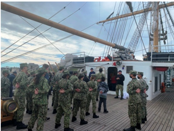
Onboard Coast Guard Barque Eagle.