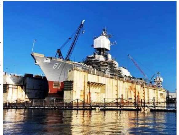
DDG 81 in dry-dock in Florida.

Our Council adopted this Arleigh Burke class guided missile destroyer, following her port visit to Stamford, CT in August 2003.