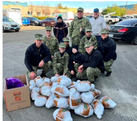
Working at Thanksgiving Basket Brigade in Bridgeport to aid needy families.