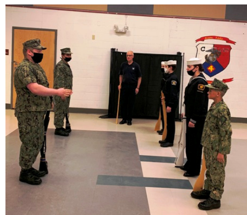
Training with Silver Dolphins color guard team from Groton Sub Base.