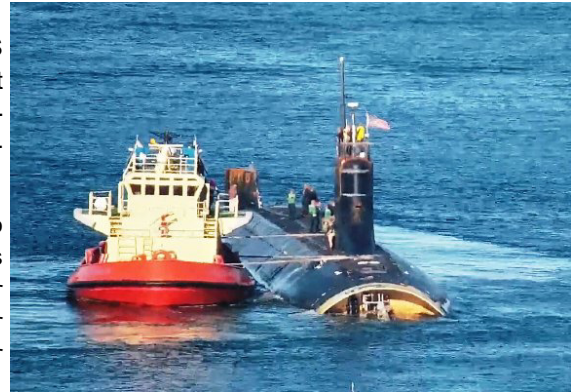
SSN 22 in San Diego in December 2021 after accident to bow area.