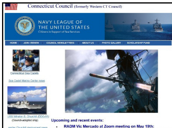
Website screen shot.

See our Council's award-winning website for special features and updates that occur between the editions of this newsletter at: www.navyleaguewestct.org