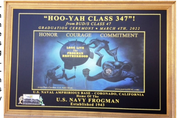
Above life-sized plaque is a gift to Class 347 from Class 47.