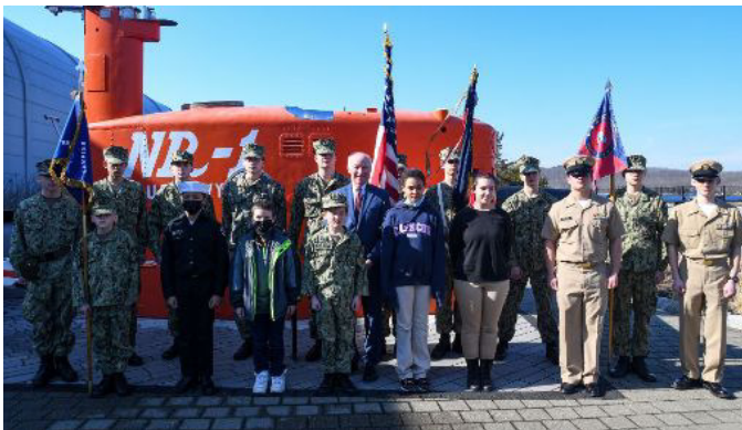
With Congressman Joe Courtney (center).