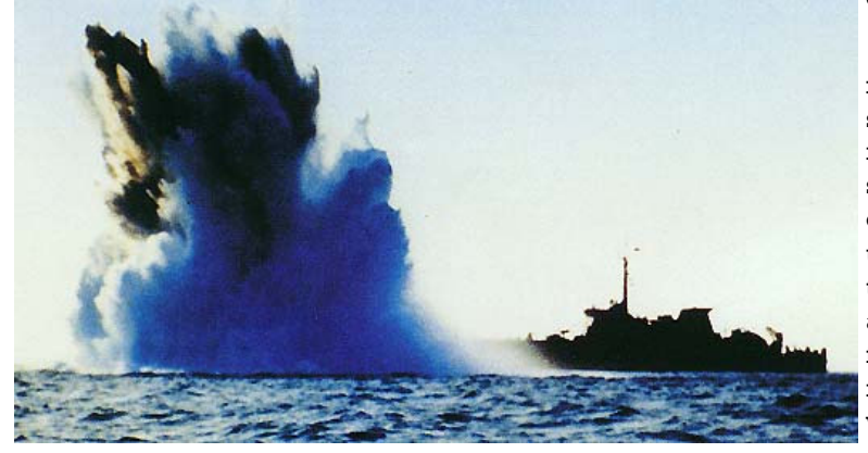
Minesweeper exploding a mine that had been swept to the surface, with gunfire from a stand-off distance. Note the size of the explosion versus the size of the ship.

As an example of the effort mines could require, after heavily-mined Cherbourg, France, was retaken from the Germans in 1944, eight sweeps were conducted every day for eighty-five days before the harbor was deemed fully safe.