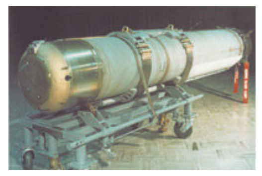
Post-WWII air-launched combination type bottom mine.

Japan laid over 50,000 mines during the Pacific war. Not all landing sites, harbor approaches and the like were mined. But the possibility of mines meant that any new areas entered had to be swept. Luckily for the men of YMS 339, the Japanese "only" used the simpler types of mines, mostly contact mines and some magnetic mines. But, as we shall see, before the war's end Maurice and his crew would be asked not only to face Japanese mines but also their own more dangerous Allied ones, and to do so while under enemy artillery fire.