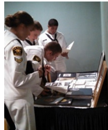
Cadets with DE memorabilia.