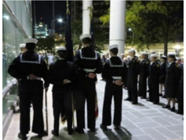
Muster at Presentation Night.

One important component of this event is for the cadets to practice public speaking. The presentations were interesting and all attendees enjoyed the evening.