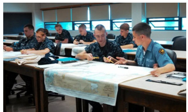
Sea Cadet chart training.