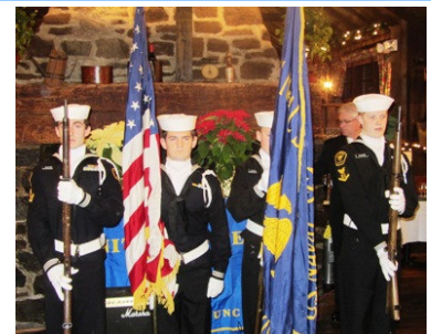
Sea Cadet color guard at 2012 annual meeting.

At this, our annual member meeting, members will also be asked to vote on our roster of officers for year 2014.