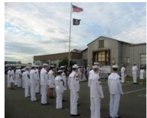
Sea Cadets at Magee Avenue Marine Center.