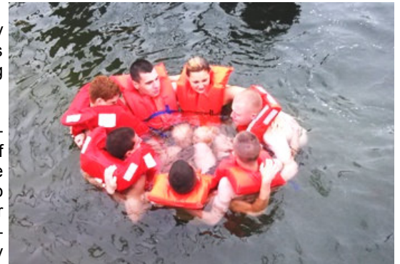
Cold water survival training.