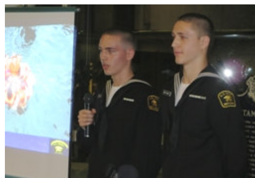
Cadets at Presentation Night.