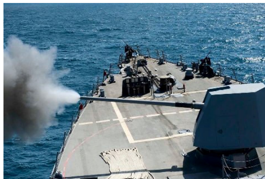
Gun exercise at sea recently.

We continue to wish all those deployed in our defense, and especially the men and women of Churchill, full success in their mission and a safe return home.