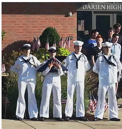
Dealey Cadets who attend Darien High School at their 9/11 ceremony.