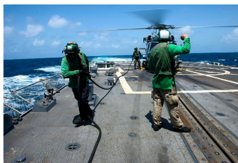
Air ops in Arabian Gulf.