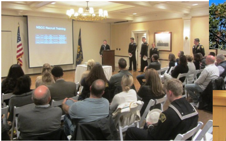
Photo above and right are from Dealeay Division training presentation night. Cadets got public speaking experience while discussing their summer training, which ran a gamut including basic training, to scuba qualification, to sailing, to serving on Coast Guard harbor craft in San Francisco, to drone flying.