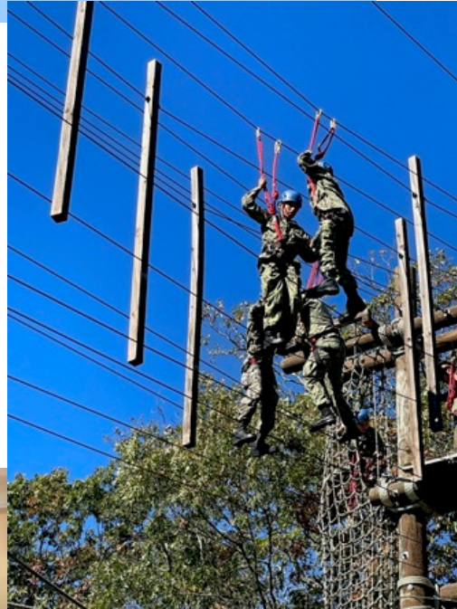
Nautilus Division cadets on the high rope course at the Naval Sub Base; building confidence and team work skills.

Each unit is overseen by volunteer adult staff following national guidelines. Here are photos of some recent events at several of the units.