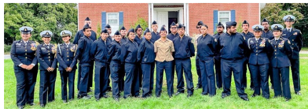
Top left and above: McMahon Cadets at mini boot camp in East Lyme. Top right, participating in "walk to end Alzheimer's" at Calf Pasture Beach in Norwalk.