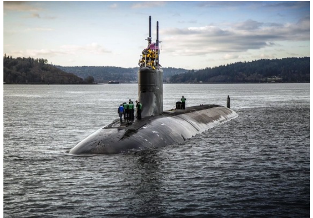
SSN 22 in Puget Sound in 2016.

Our Council "adopted" this Seawolf class nuclear fast attack submarine in 2016. There are 3 Seawolf class subs that are the quietest and fastest in the fleet. Our Council has been in contact with the new CO and XO, and we send them and their officers and crew our best wishes.